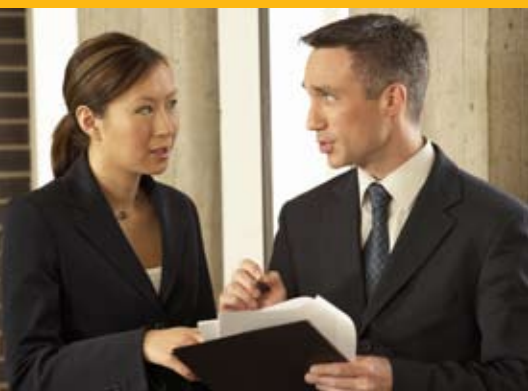
Image. Your company's image and work environment are important to your customers, clients and employees. Your interior space is a reflection of your success. Framed artwork,

awards, mirrors, and more provide the finishing touches to an office interior. It's one of the most affordable ways to enhance your company's image and create a productive work environment.